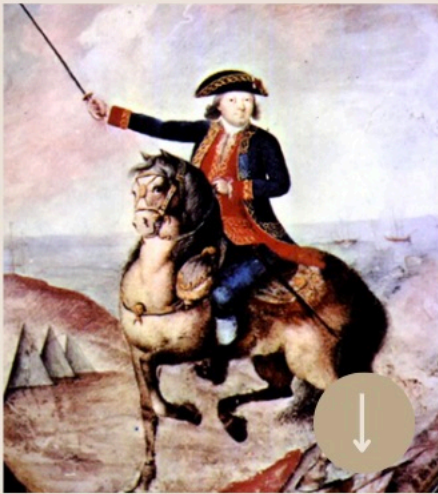
Don Bernardo de Gálvez y Madrid