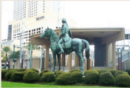
Former site of monument in New Orleans.