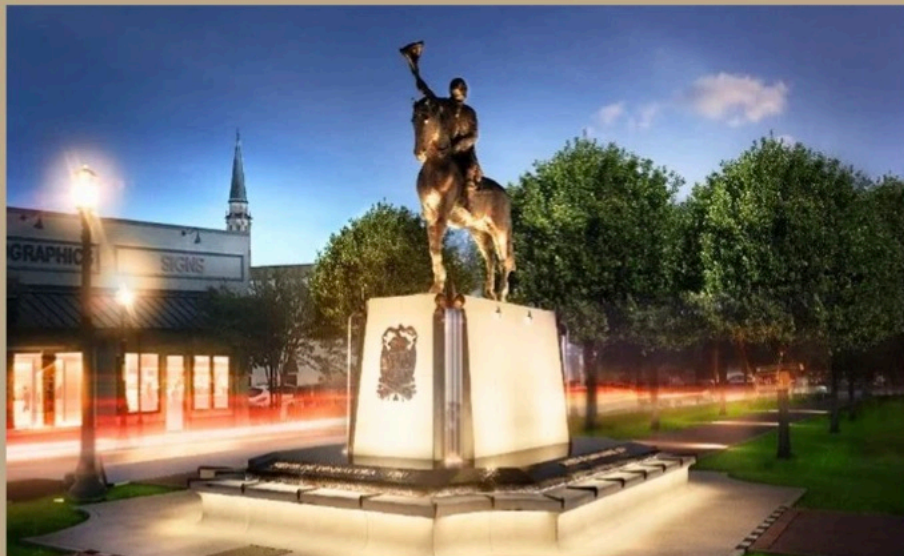
Gálvez Monument in Pensacola, Florida