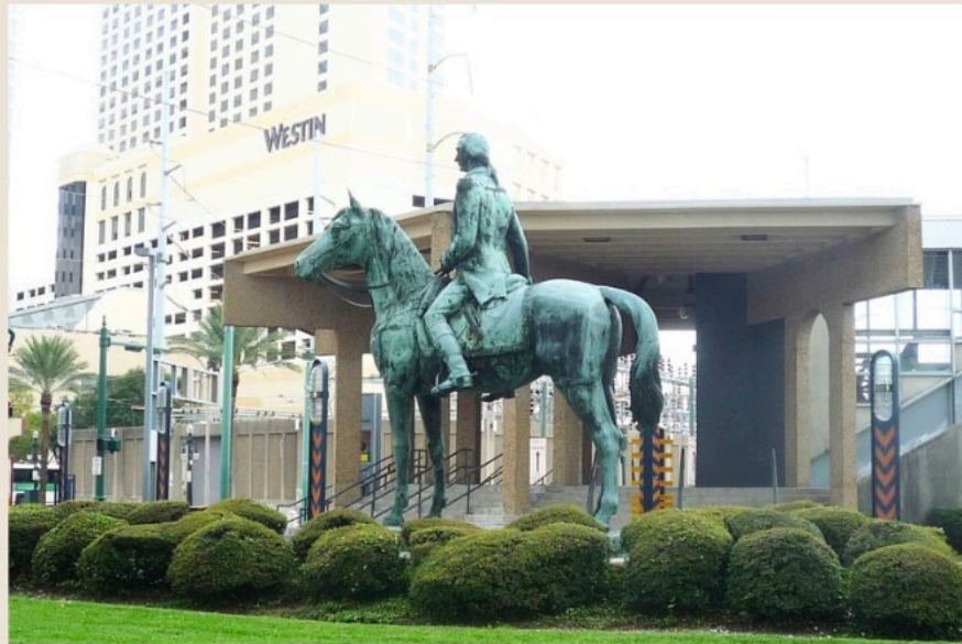
Former site of monument in New Orleans.