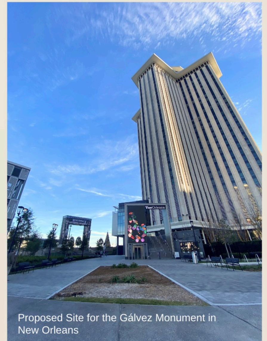
Proposed Site for the Gálvez Monument in New Orleans